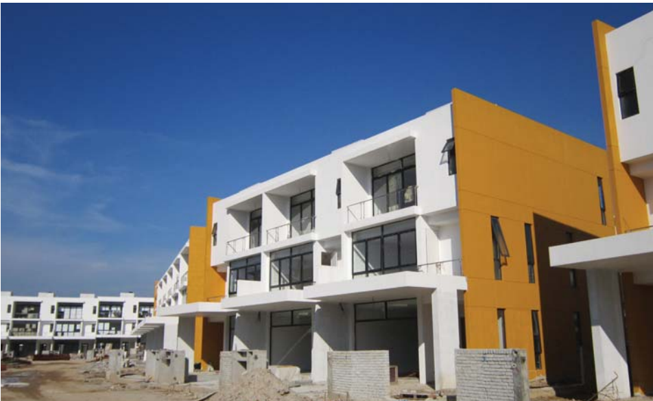
Architectural and external works are in progress.