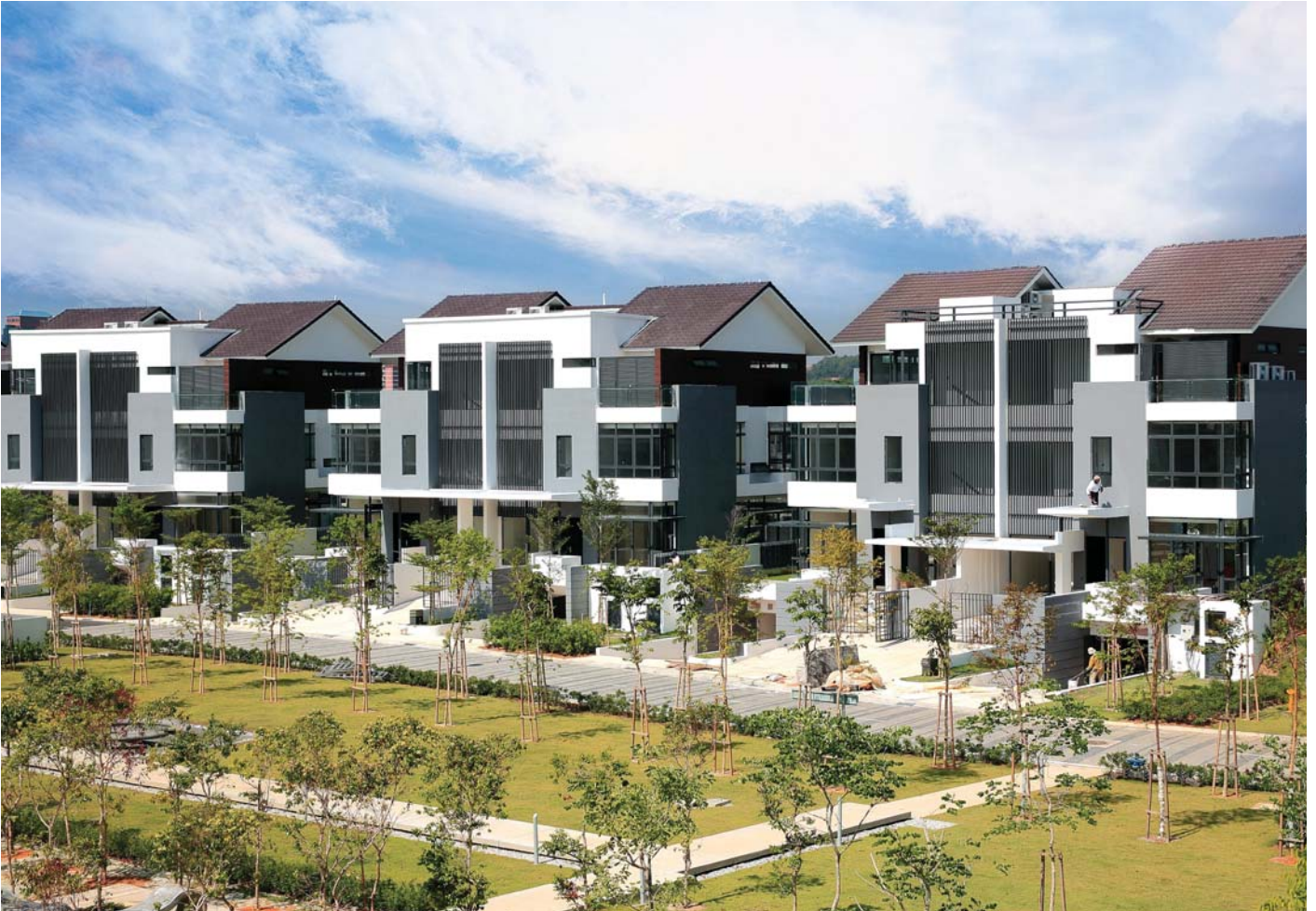
Grove, Type A Semi-D homes: 3-storey Semi-D with private pool, lift and basement parking.

Construction of the 98 units of semi-detached homes has been completed, with much of the remaining works focused on finishing touches for architectural works and landscaping of the development.