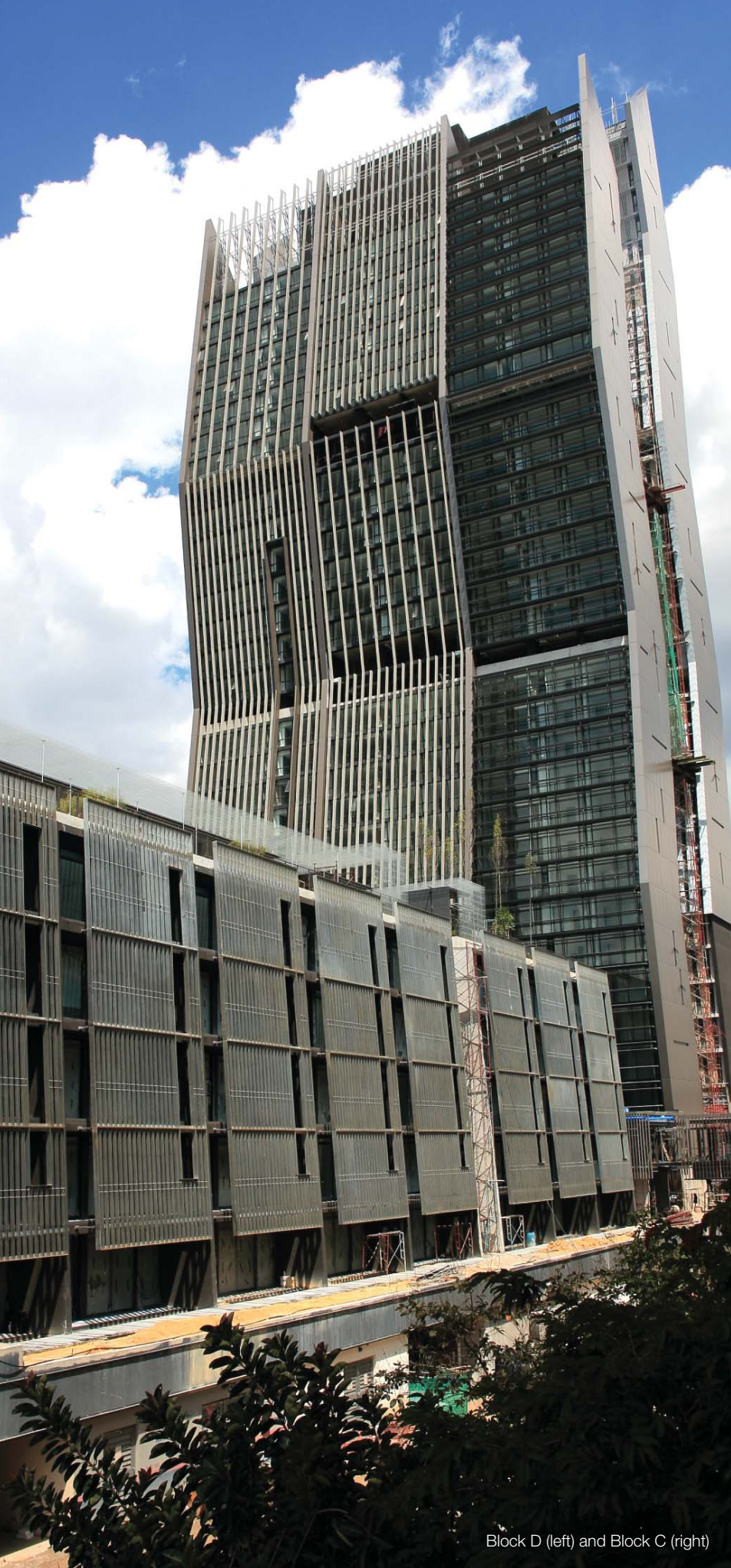
Block D (left) and Block C (right)