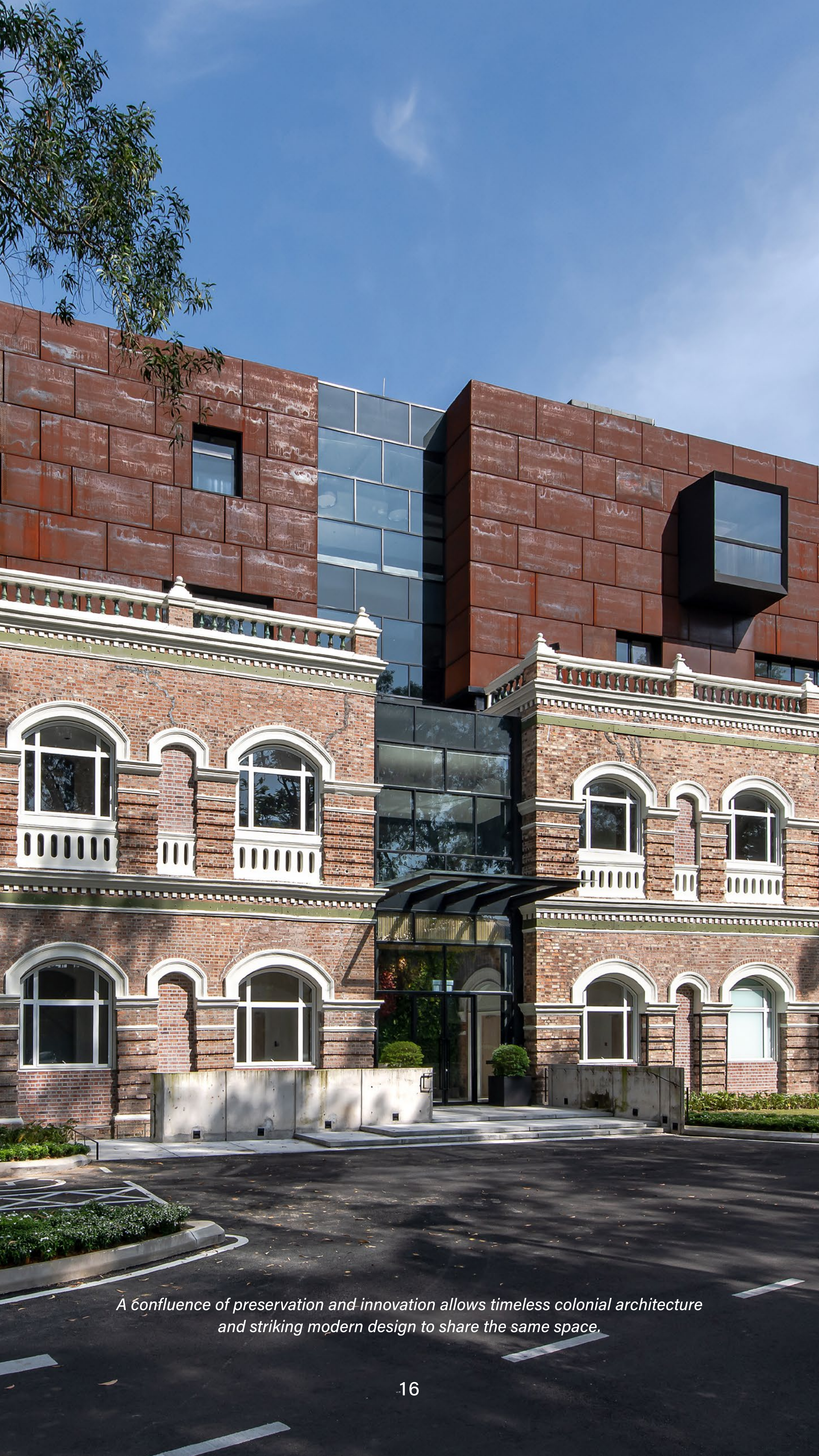
A confluence of preservation and innovation allows timeless colonial architecture and striking modern design to share the same space.