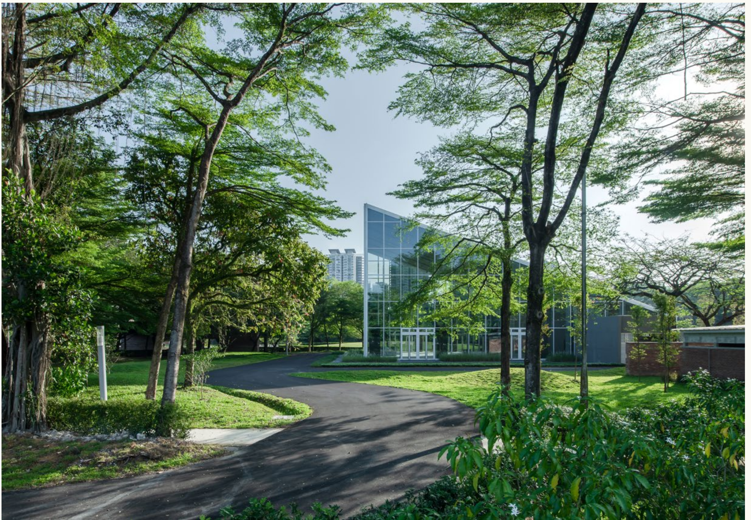
The calming influence of verdant greens give Sentul Pavilion a unique character that befits this one-of-a-kind venue.

Yet, it is not just an outstanding address that makes this a special destination to entertain for celebratory occasions. The glasshouse fully embraces its fetching surroundings, seamlessly drawing lush greens of the park for guests to simply enjoy the modern, minimalist space as is.