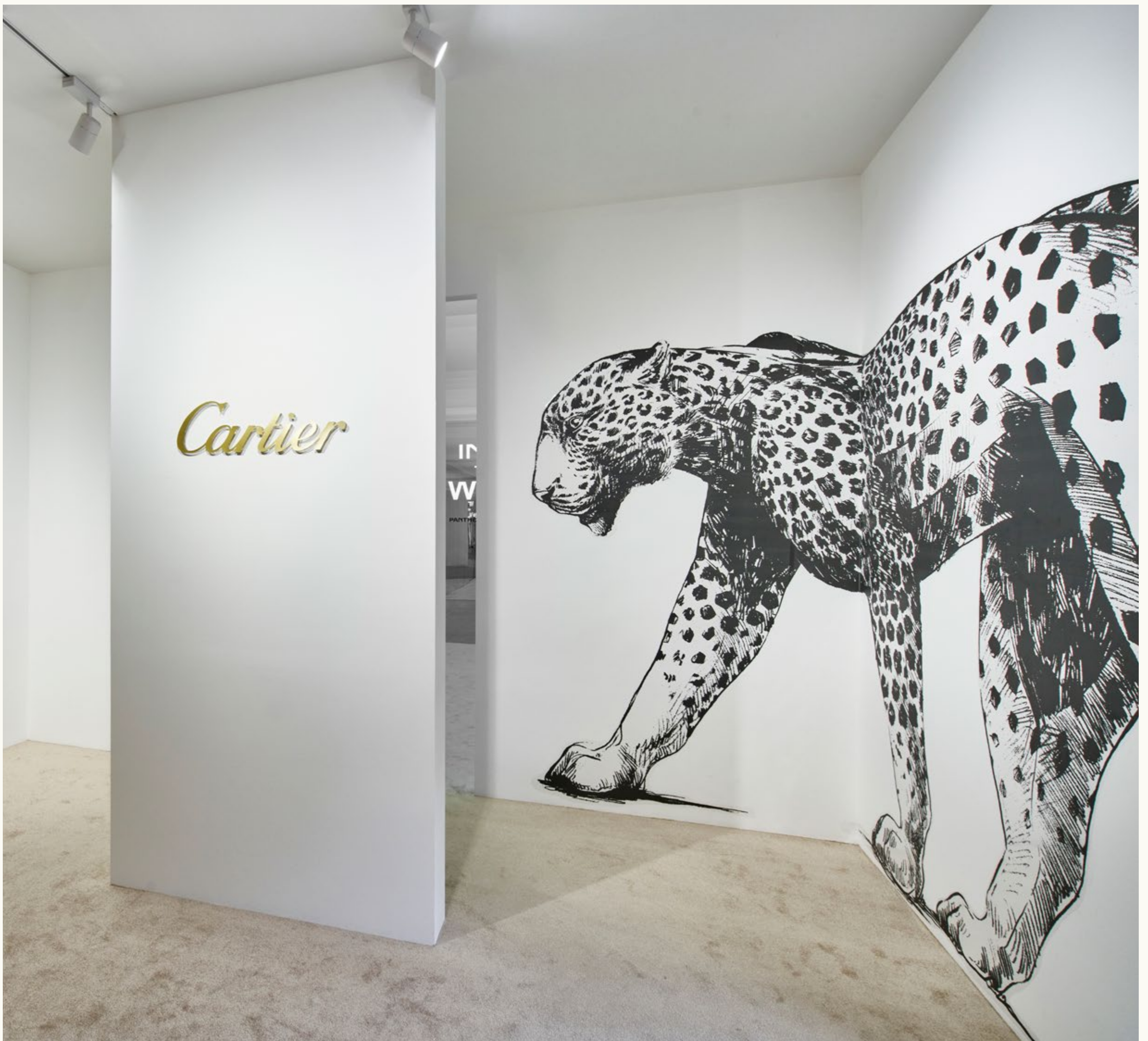
A flair for design and artistry adorned walls, creating an atmosphere that pays homage to the Panthère design heritage.

Sentul Depot's Workshop 3 was transformed into an atelier, taking guests on an immersive experience through time from when the panther first showed its spots on a woman's watch in 1914 to its evolution in present day.