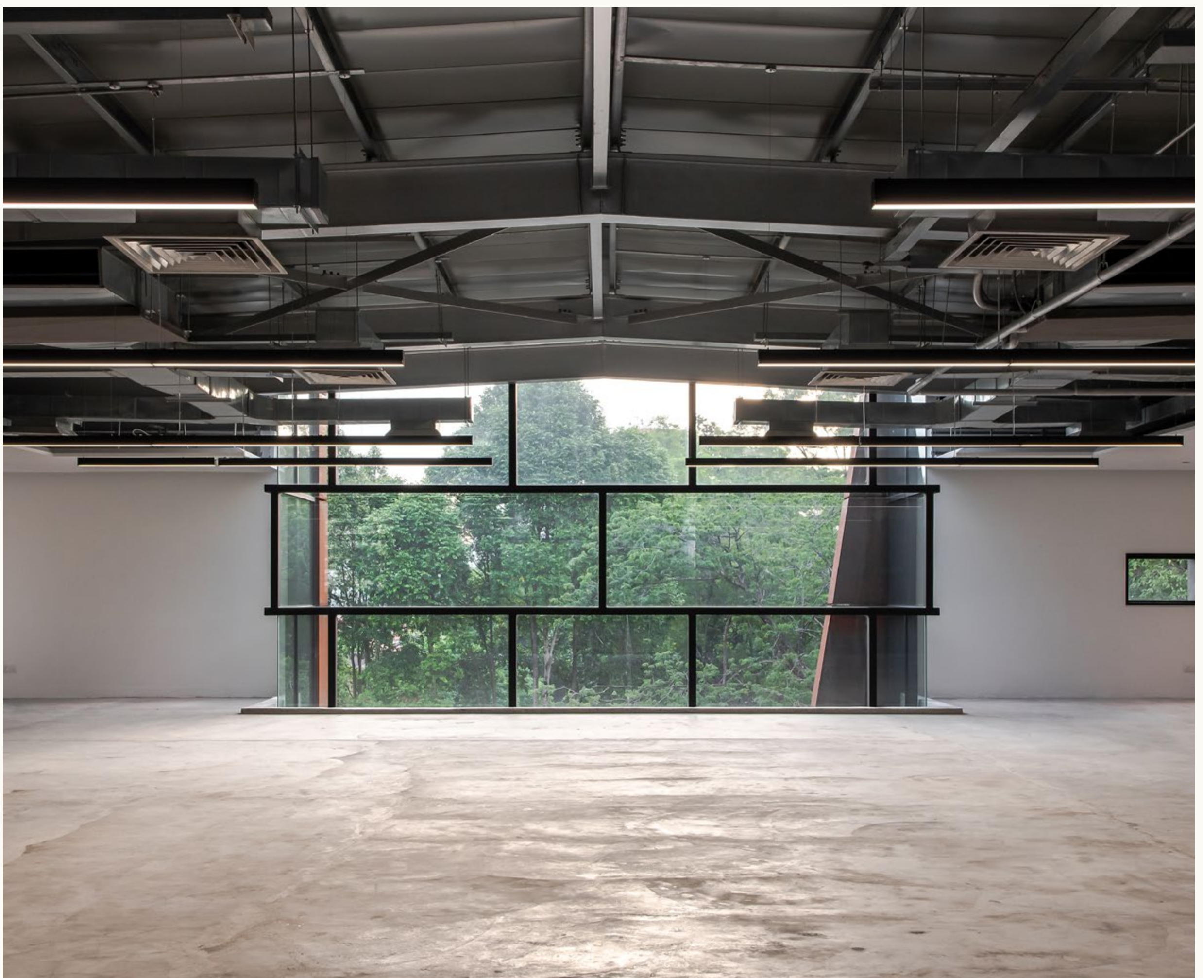
A true sense of spaciousness enhanced by natural light in a modern office environment.

Perceptive of the fact that today's urbanites typically spend one-third of their life at work, YTL Land is paying much-needed attention to enhancing the environment of work spaces, and by adopting the biophilic philosophy to create a benchmark work and live experience.