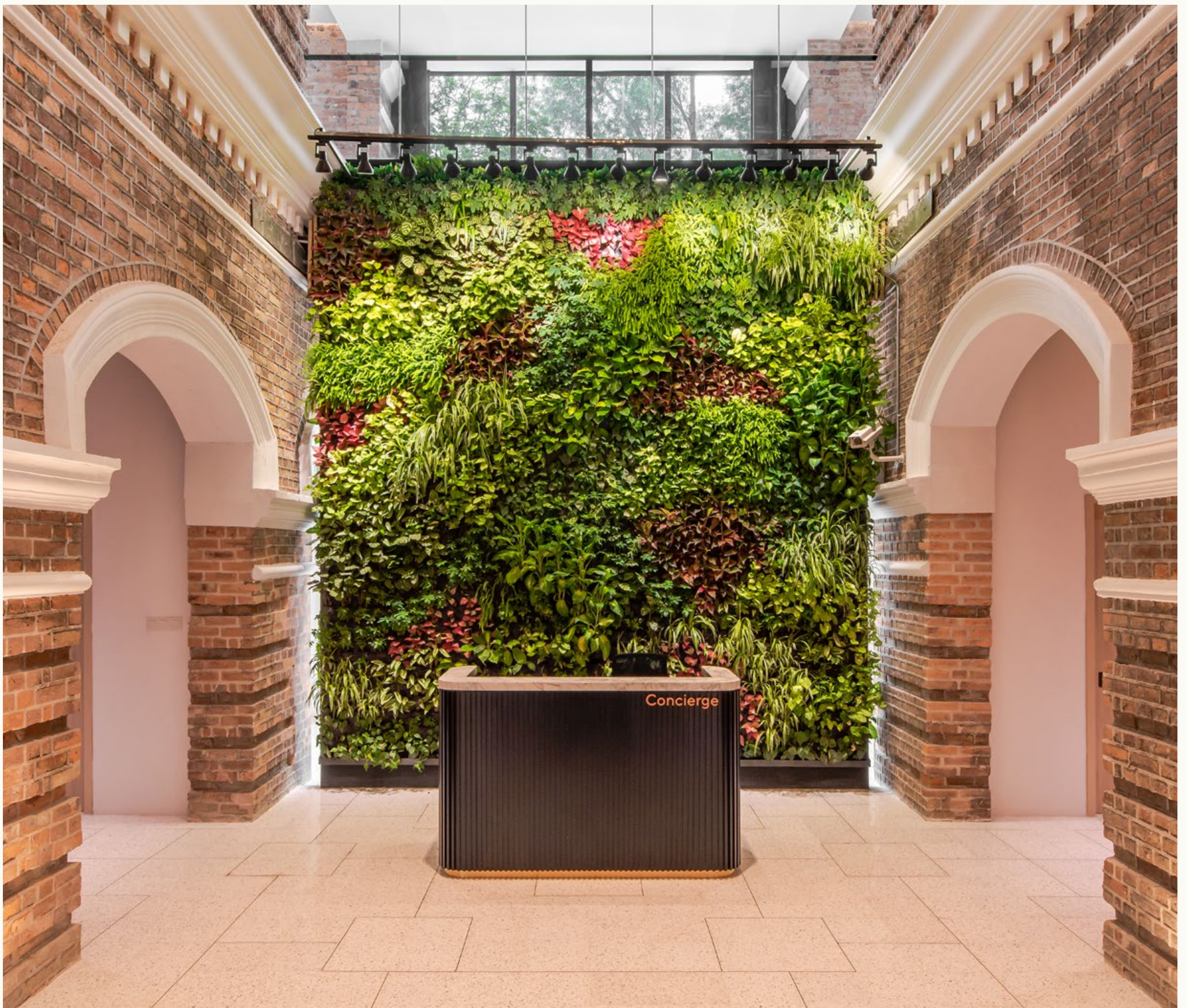
Infusing a modern design into a beautifully rustic space, Sentul Works plays tribute to the building's colonial architecture and rail heritage with eye-catching contemporary flavour.

As YTL Land continues its journey of evolution to achieve a sustainable future for all, our development efforts will continue to focus on delivering unique and conducive biophilic designs that are reflective of the nature-health relationships in the built environment to enhance lives through connection and reconnection with nature. This is a future that we will continue to invest in.